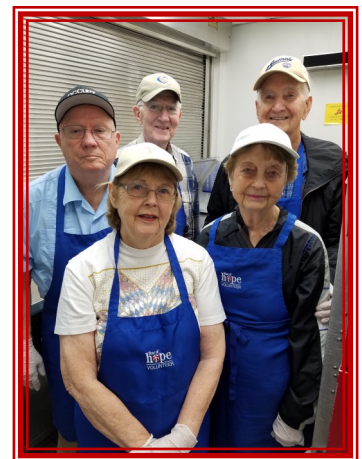
Star of Hope Volunteers