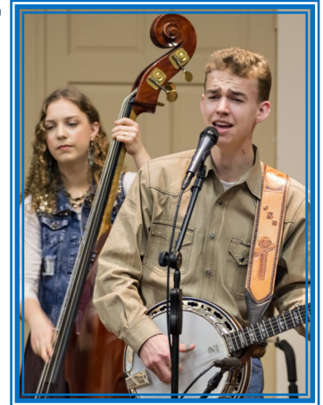
Sowell Family Pickers