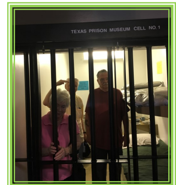
Texas Prison Museum